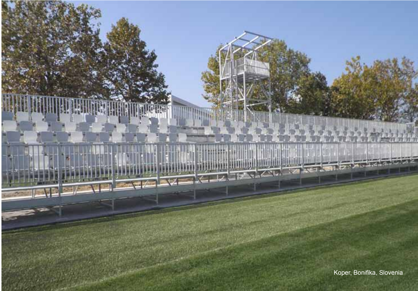
Koper, Bonifika, Slovenia