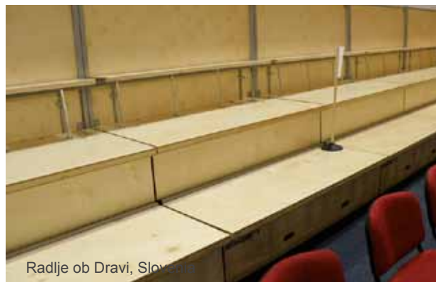
Radlje ob Dravi, Slovenia