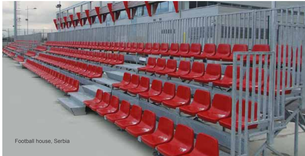
Football house, Serbia