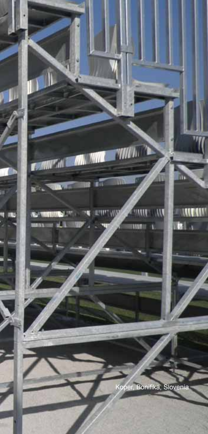
Koper, Bonifika, Slovenia