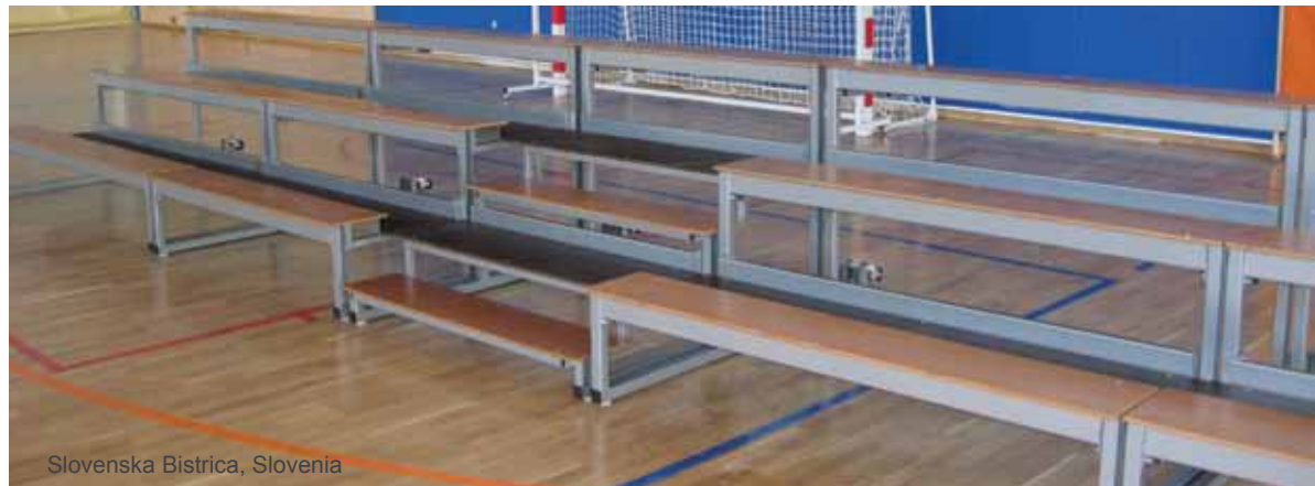
Slovenska Bistrica, Slovenia