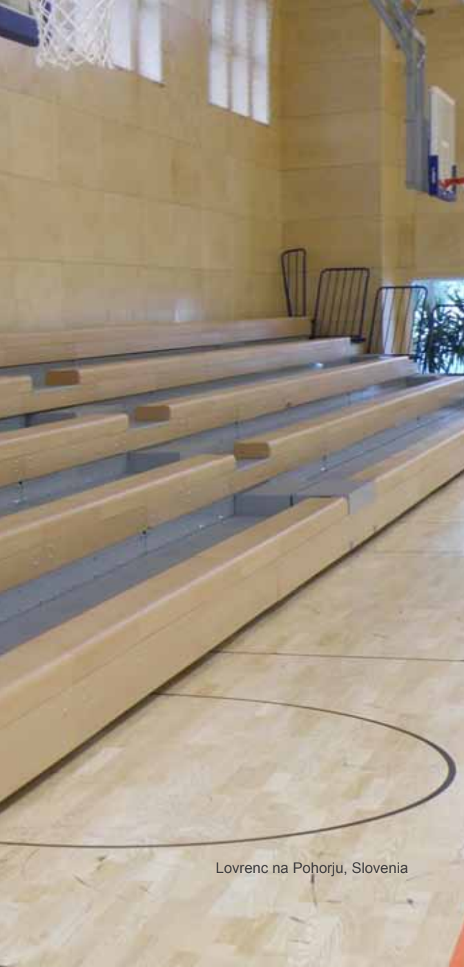
Lovrenc na Pohorju, Slovenia